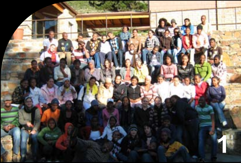
1. Peer educators smile for the camera at the OIL camp