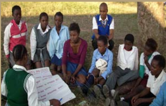
MASOYI peer educators deliver a session during the HIV/AIDS workshop

A community event was held where the facilitator team and peer educators targeted youth between the ages of 11 and 13 within one of the surrounding communities. The focus of the day was to inform youth about making the right choices and the importance of understanding the consequences of making the wrong choices. Drama, music, dance and interviews with PE's were used to communicate the message.