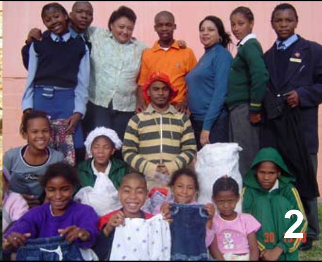
2. OIL peer educators with the staff and children of The Valley Development Project in Ocean View.