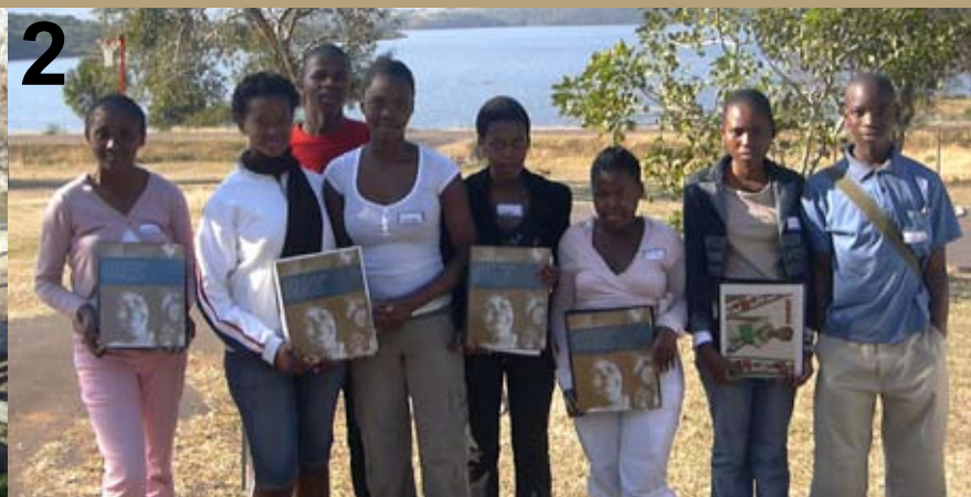
1. Facilitators enjoying GOLD camp training in Midrand 2. Sethani peer educators proudly showing off their portfolios