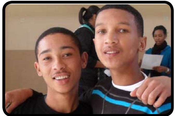
ISC peer educators conducting holiday clubs over the World Cup period.