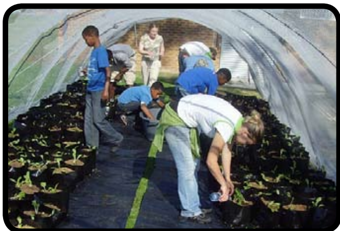
CAWO food tent being set up