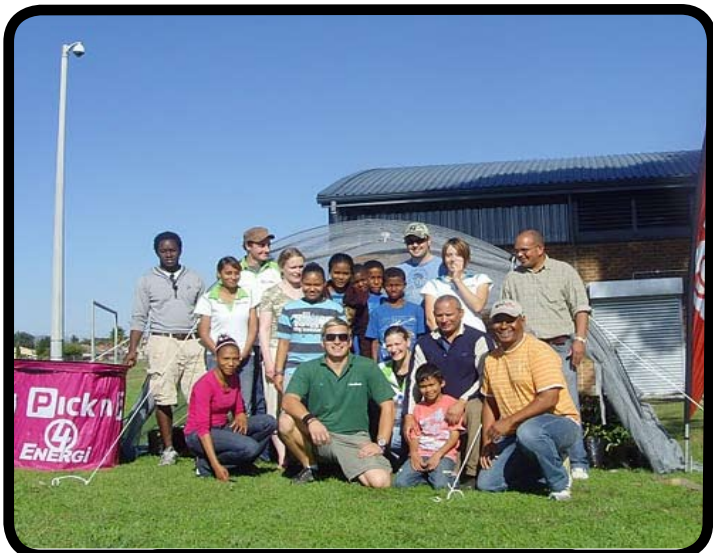
THE CAWO FOOD TENT TEAM