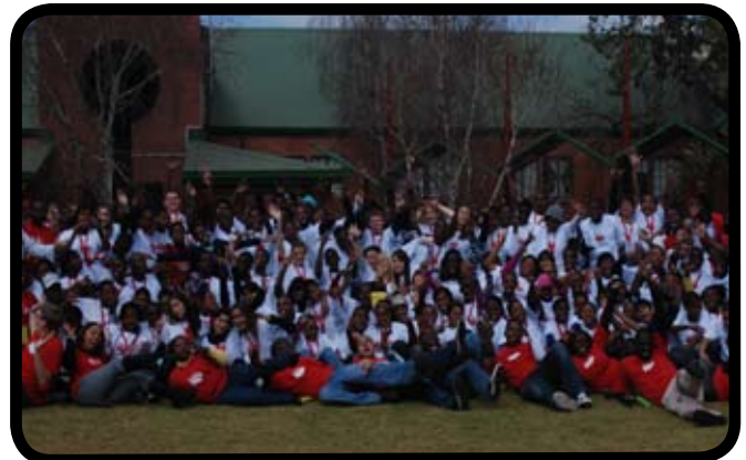
Annual ENKE Forum : Grade 11 learners and GOLD Peer Educators in Johannesburg

“ As a Peer Educator the forum has opened my eyes and made me realize that as we are human beings when working in groups or pairs, we have differences but we shouldn’t let them justify our way to the future but have to put them aside in order to succeed”