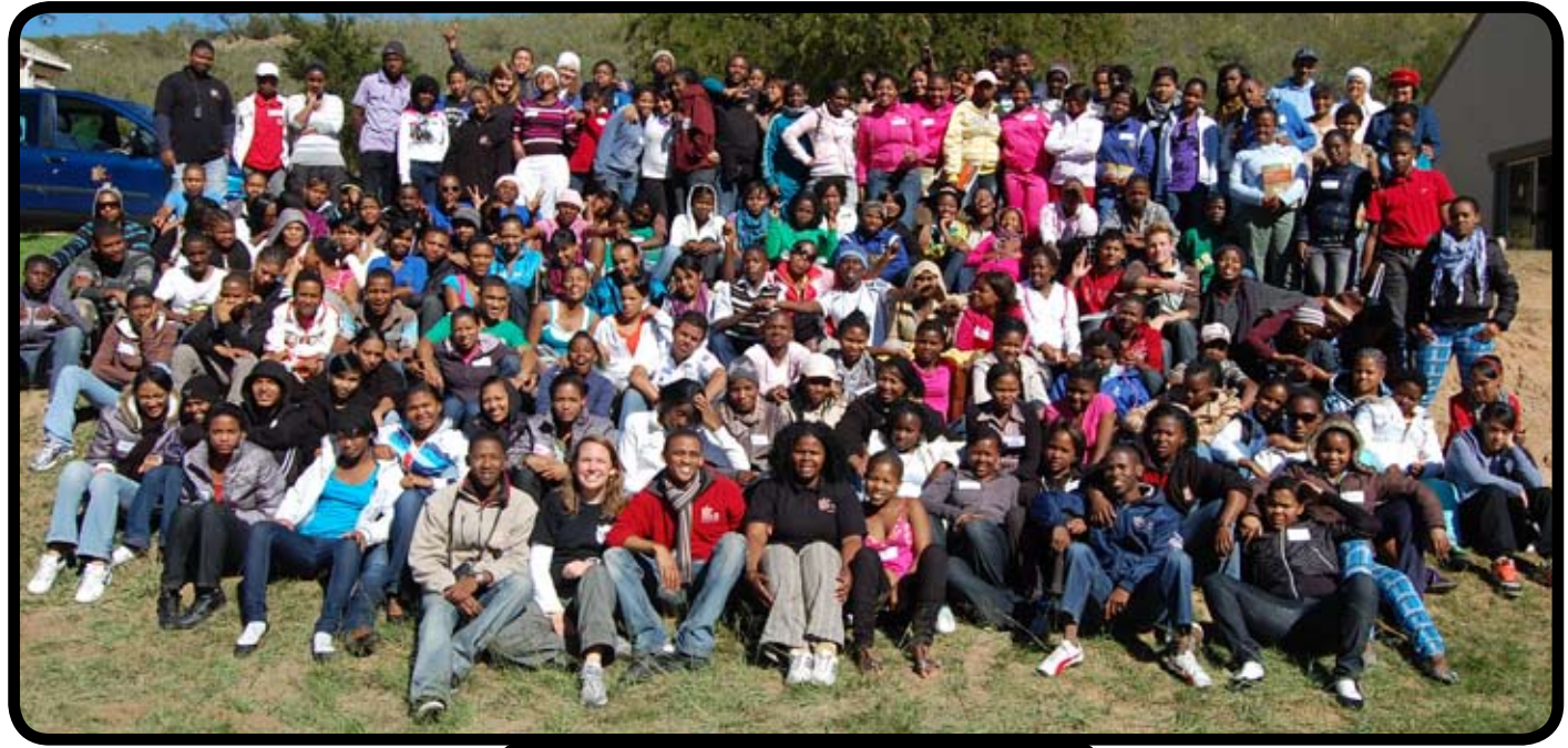
THE YFC GEORGE SENIOR CAMP