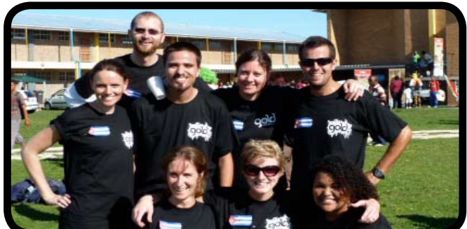
A tired GOLD team after being soundly beaten by the CAWO peer educators.