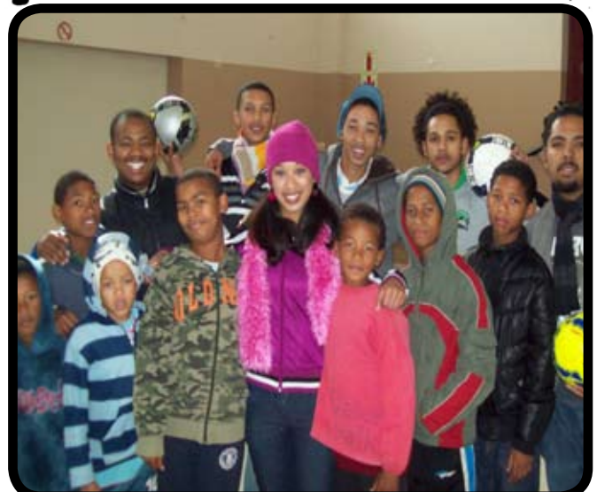
ISC peer educators conducting holiday clubs over the World Cup period.