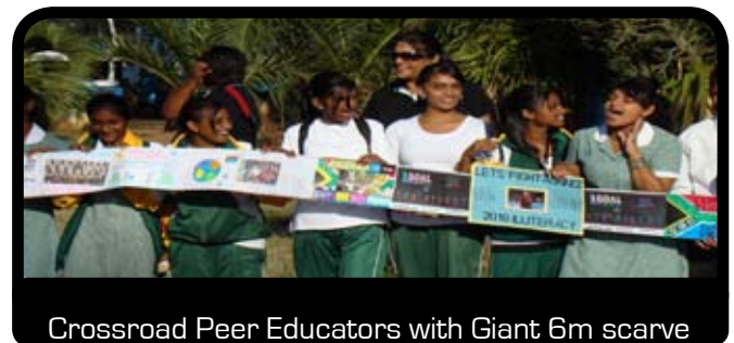
Crossroad Peer Educators with Giant 6m scarf

The GOLD Peer Educators were also positively involved in championing the well being of children during and after the 2010 World Cup through various community events and kids clubs around Durban. GOLD Peer Educators hosted about 25 kids club in the Durban and the surrounding areas, making this the biggest community upliftment activity ever undertaken by Hope2Educate GOLD Peer Educators. GOLD Peer Education is a Champion for Children indeed!