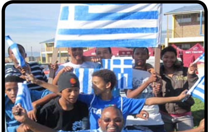
The guys from Elgin show the Greeks how it's done at the Ukuthasa soccer day.