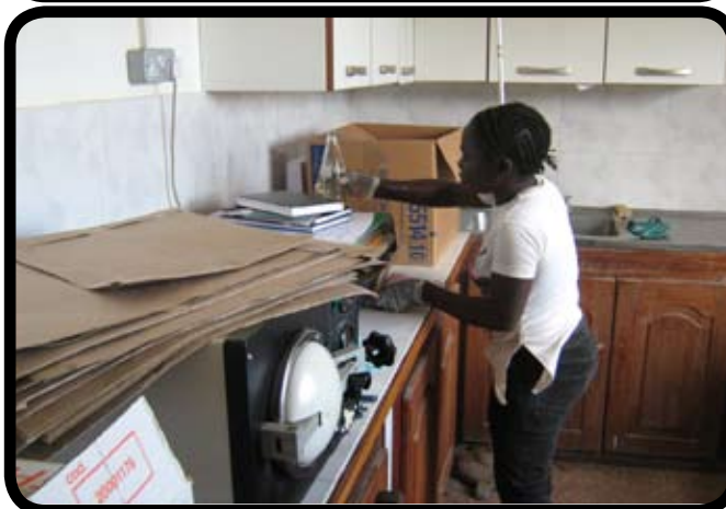
PE's from Mwaiseni in Zambia, clean the Malaika a clinic premises on Zambia's youth day.

On Zambia's Youth Day, a number of GOLD Peer Educators descended on the Malaika clinic armed with brooms, buckets and cleaning equipment. They spent the day hard at work cleaning and scrubbing the clinic premises to ensure their local clinic was spick and span. The clinic staff were very grateful for their efforts and thanked the peer educators for giving up their holiday to serve their community.