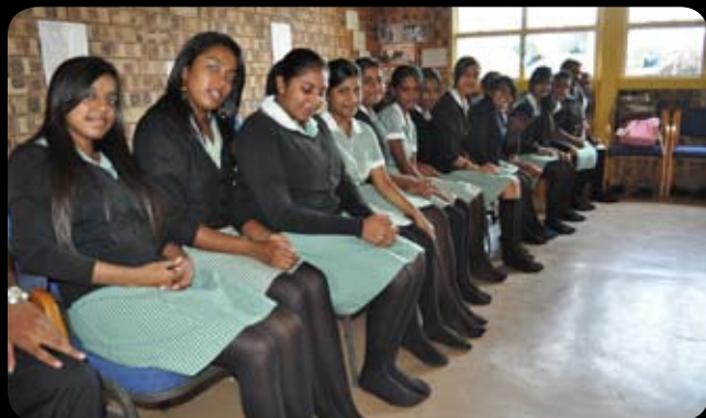
Crossroads peer educators without shoes. (Kwazulu Natal, South Africa)

Crossroads facilitators and presented new pairs of school shoes to each child in the Ekukhanyeni, Mjosi and Thumbela Primary Schools. By the end of the campaign the peer educators were elated as they felt they had made a significant contribution to underprivileged children.