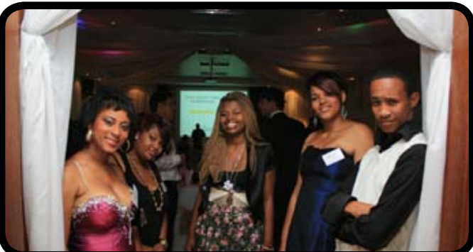
Lead Peer Educators from ISC, Ukuthasa, CAWO and YFC George (Western Cape, South Africa)