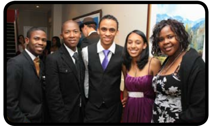
Facilitators from different Implementing Organisations in the (Western Cape, South Africa) connecting with each other.