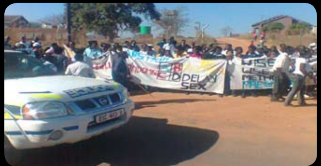
Masoyi Peer Educators during an Awareness march on the 16th of June different stakeholders such as SAPS, teachers and parents were present to support the event. (Mpumalanga, South Africa)

I will keep on shining because there is GOLD inside me. (GOLD SHINE!)