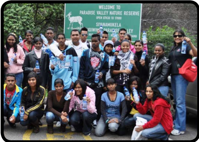
Crossroads Mentor Peer Educators during a workshop at Paradise Valley where they also had a hike. [Kwazulu Natal, South Africa]