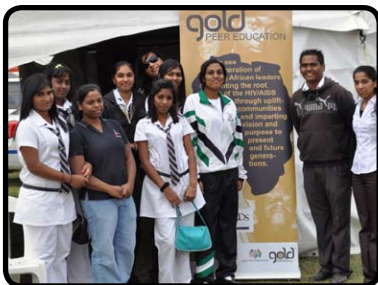
Crossroads Peer Educators during Earth Day Celebration (Kwazulu Natal, South Africa)