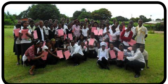
Society for Poverty Eradication Peer Educators on their graduation ceremony. [Zambia]

Across GOLD's countries the start of 2011 has seen the Training and Support teams working hard to roll out a number of trainings. These include Equip to serve Master Training providing crisis counselling skills. An exciting pending milestone has been the GOLD Accreditation. GOLD is the first organisation in South Africa to have accredited assessors for the new Peer Education Unit Standards. Well done to all of you!